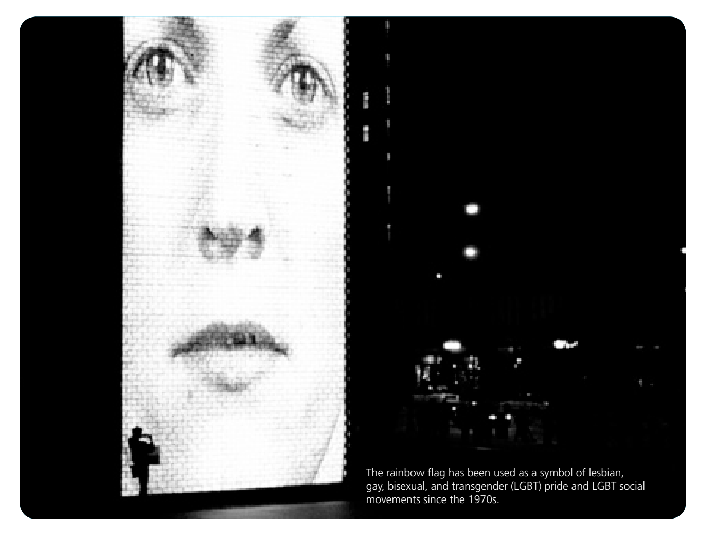
"The white light streams down to be broken up by those human prisms into all the colours of the rainbow. Take your own colour in the pattern and be just that." - Charles R. Brown

The annual London Pride will take place on 7 July. The Pride march provides the global LGBT community a chance to come together to celebrate the progress that has been made in achieving equality.