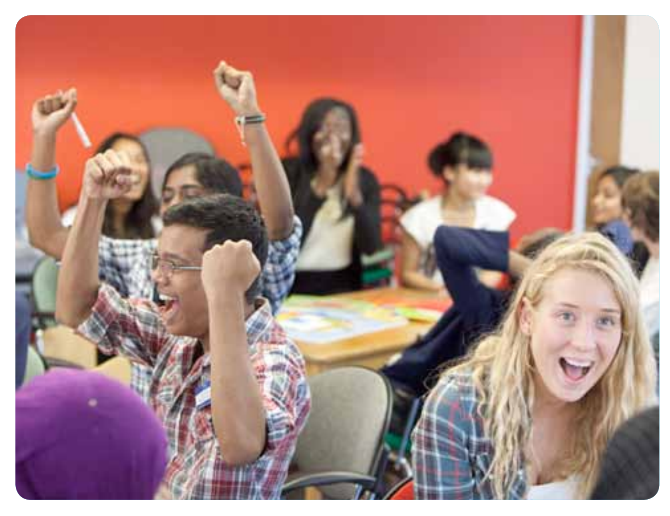
Students in LSE Summer School