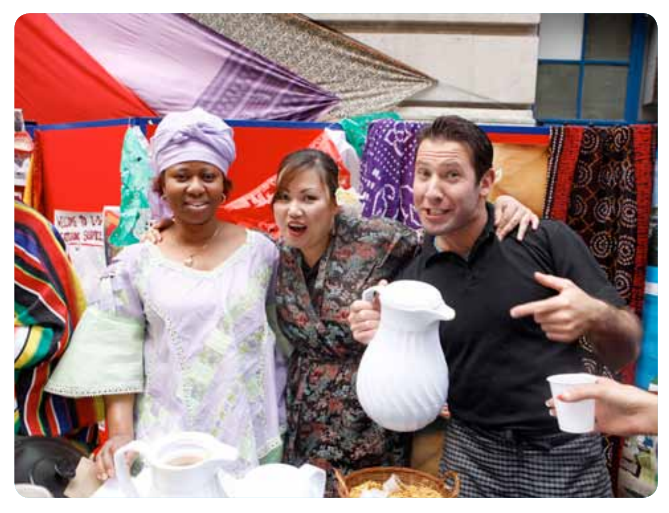
LSE Adult Learners' Week in Houghton Street