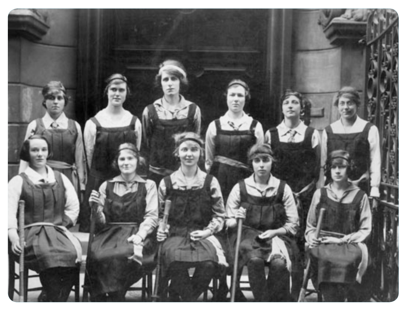
LSE Women's Hockey Team, 1920-21