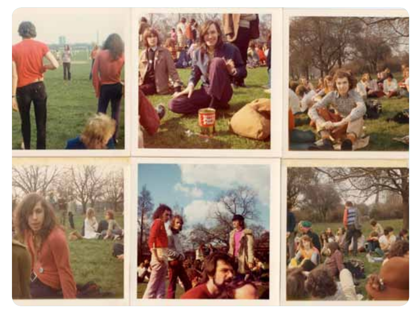
Gay Day in Holland Park organised by the Gay Liberation Front, 1973